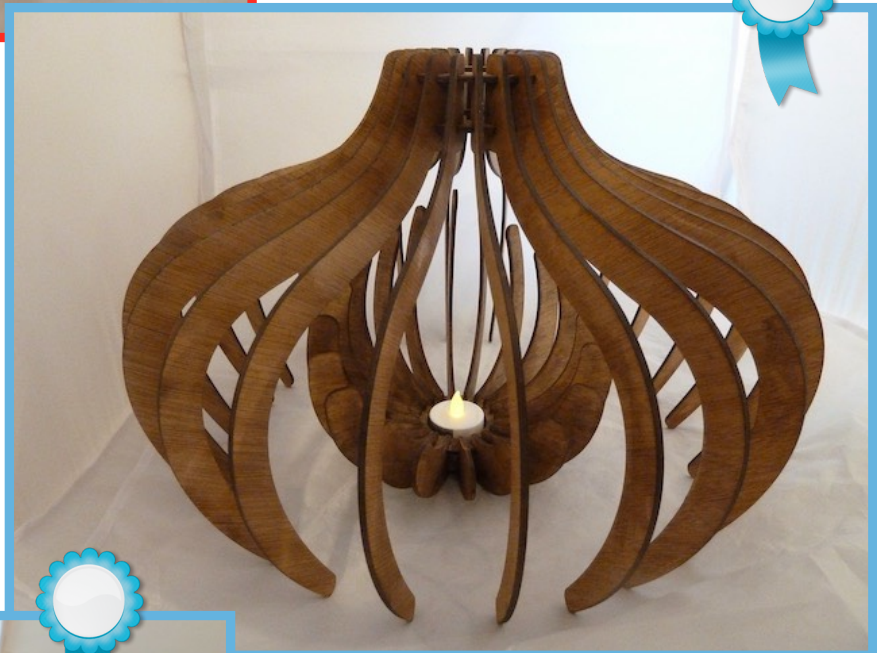
Second equal - tea light holder in Baltic Birch from Bronagh Cassidy